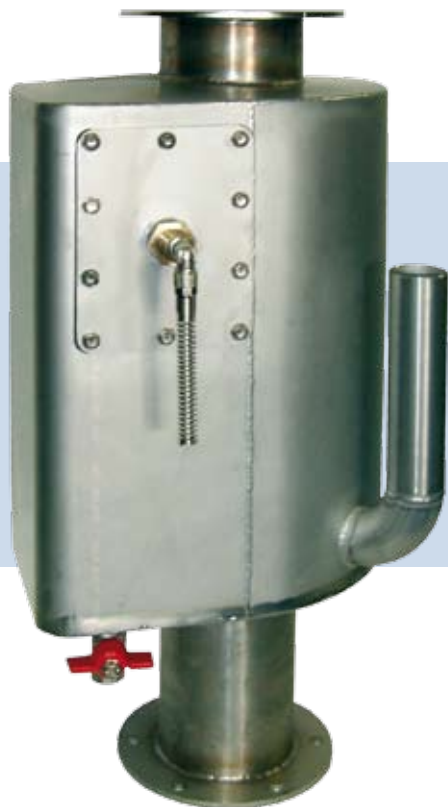
SPAD® RM 90-2B from 90 to 240 hp diesel engines, automatic water filling, 10 kg, height 50 cm